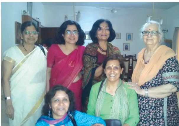
Block Printing Skill Development Workshop at Gargi College