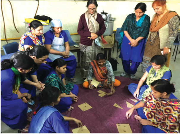
BRPID Project Training Workshop in Personality Development