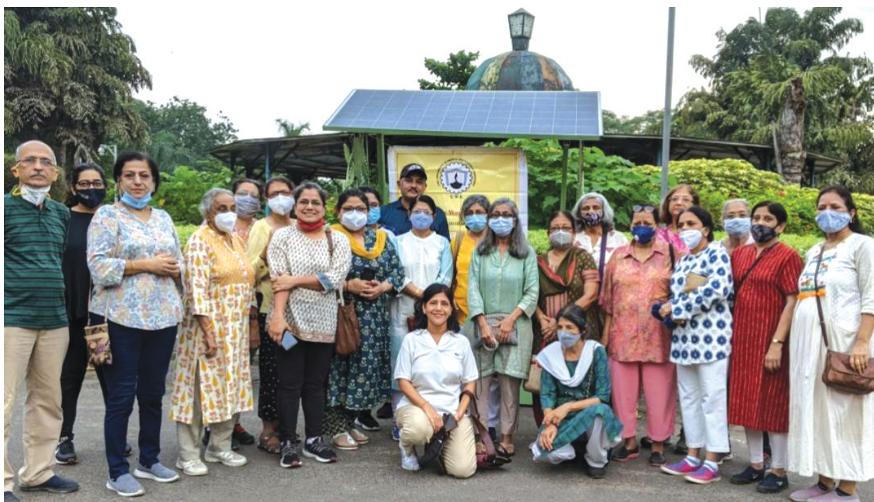
Visit to Sayaji Baugh

medical and emotional facets of the complex process of Organ Donation left us in awe of the tremendous dedication involved at every step of this invaluable gift of life.