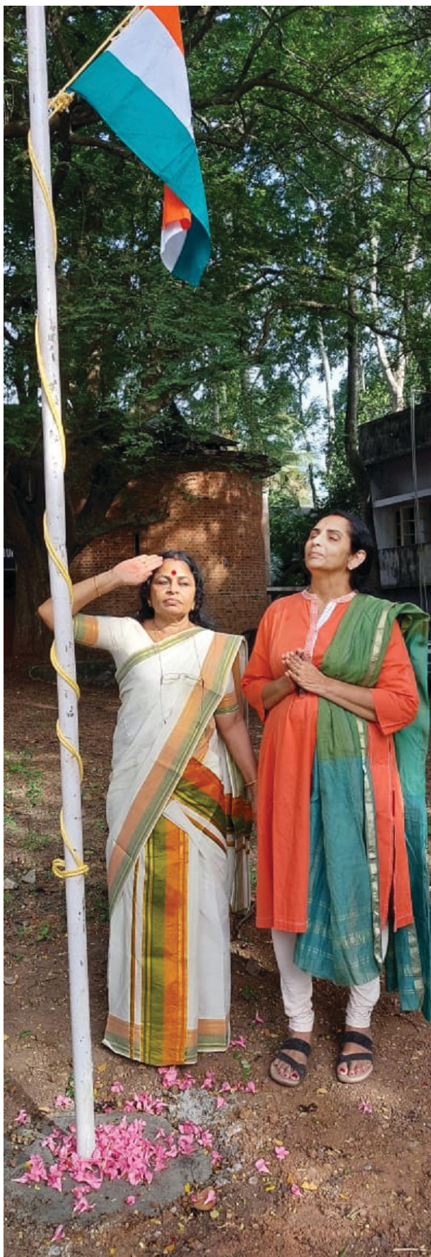
Flag hoisting on Independence Day at Lakshmi N Menon Memorial UWA Hall

presented at the meet organised by the Women and Children department.