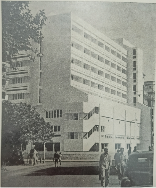
Women Graduates Union Purshotamdas Thakurdas Hostel