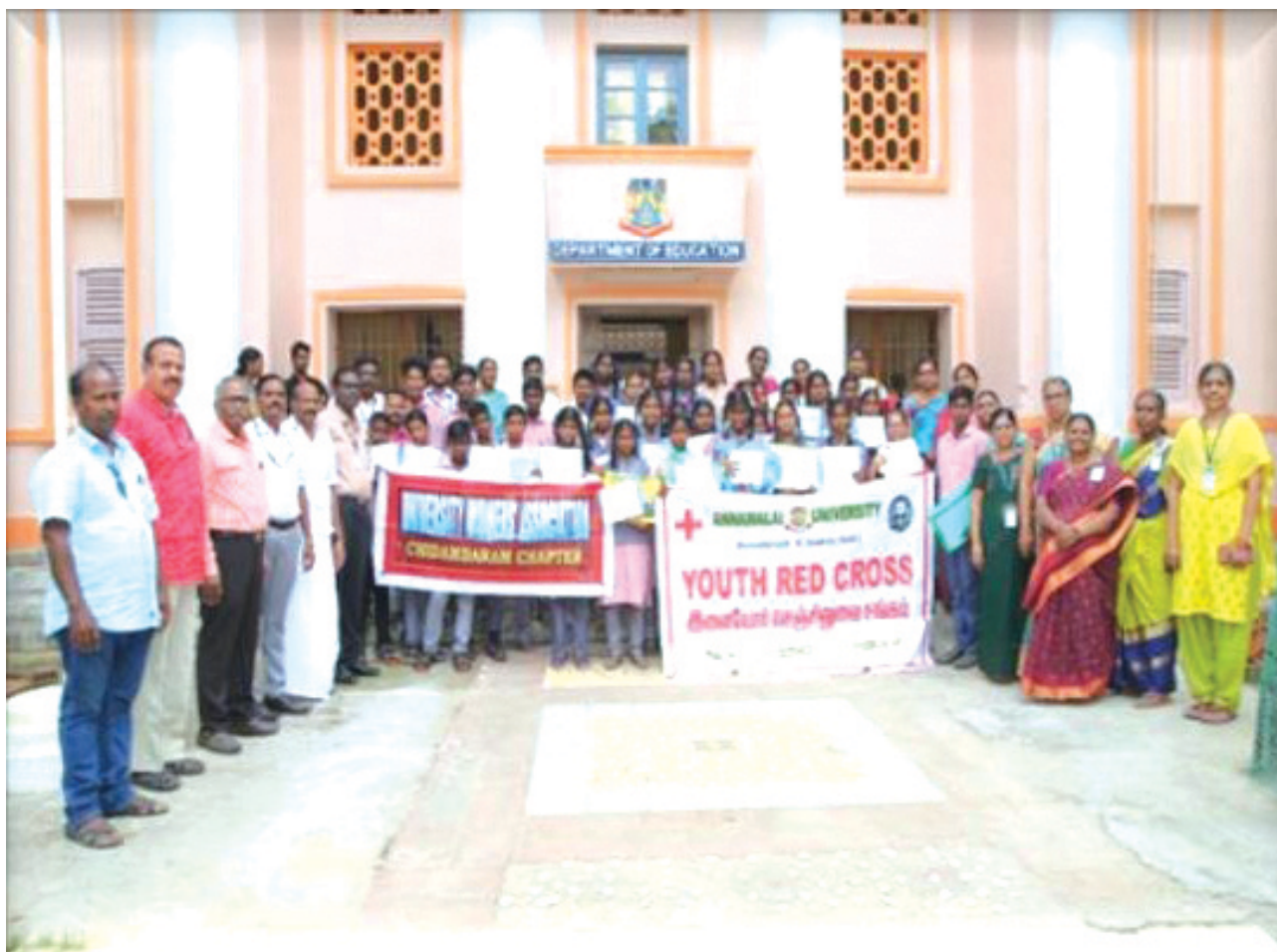
Mass rally for cleanliness of campus

Women empowerment is to promote women's sense of self-worth, their ability to determine their own choices, and their right to influence social change for themselves and others. The University Women's Association Chidambaram Chapter is conducting several programmes for the empowerment of women and the girl child.