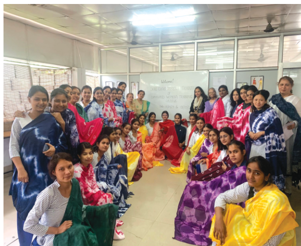
Display of Tie and Dye Dupattas by the Students undergoing Vocational Training by UWA Dehradun at ONGC Polytechnic.

Offering monthly monetary assistance to needy