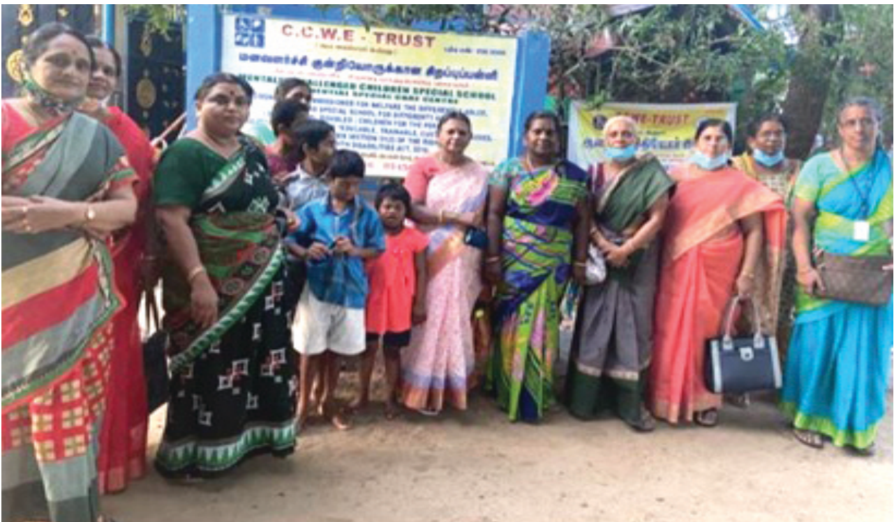
Visit to Old Age Home