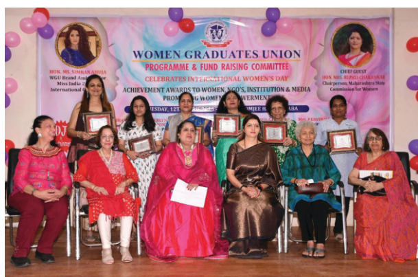
Womens Day 2023