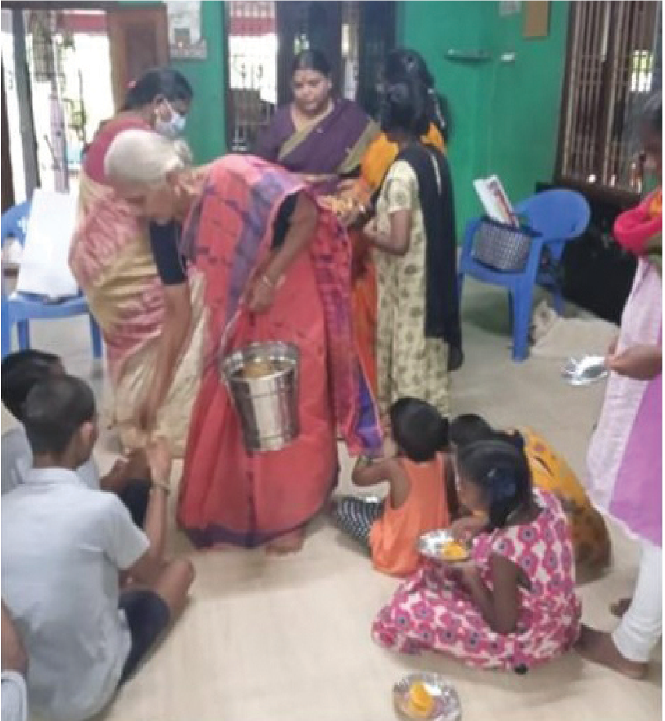
Visit to the Physically Challenged School