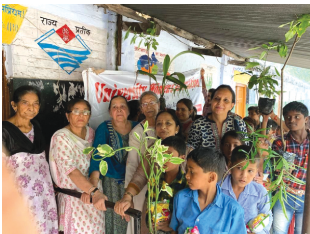
World Environment Day and planting of trees with children at Government School at Parade Ground Dehradun.

Throughout the years UWA Dehradun has held many meaningful programmes. These include socio-economic programmes, interesting talks, discussions, seminars, workshops, celebrations of important days, adoption of villages and schools, exhibitions, cultural programs, job oriented vocational