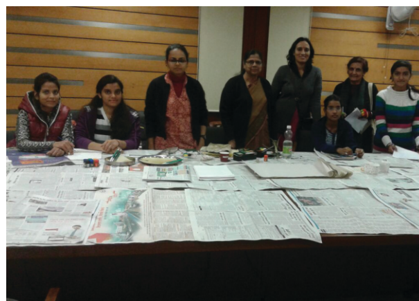
Seminar on 'Health and Nutrition' 2015

A seminar-cum-interactive workshop on "Entrepreneurship: Key to Empowerment of Women" was organised in collaboration with Swami Sivananda Memorial Institute (SSMI) in March 2016.