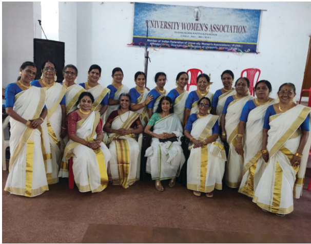
Thiruvathira Students of UWAT

need of the hour to take preventive measures. Along with continuous awareness programmes, we hope to provide counselling to the youth, on a regular basis.