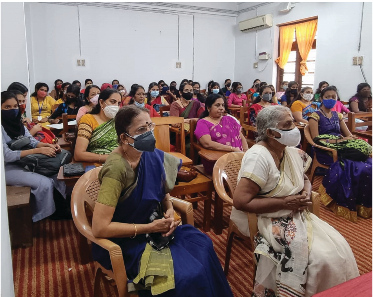
Awareness Programme at College

A Medical camp and cultural events where members can showcase their talents are other events that are being planned for the near future.