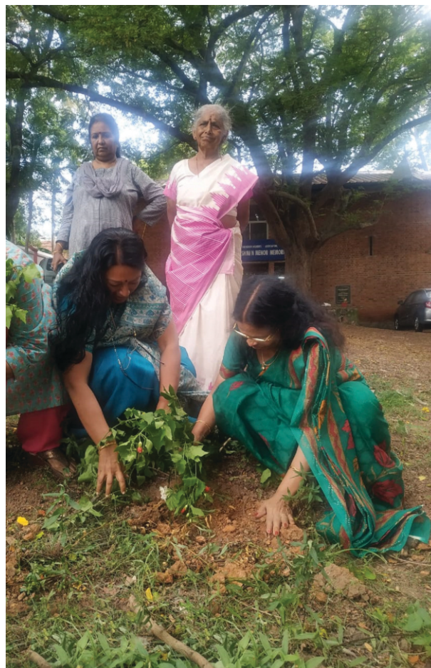
Planting Saplings on Environment Day

International Women's Day is observed every year, with talks or Awareness programmes marking the occasion. A talk on the topic 'Educate a Girl, Invest for the Future', was