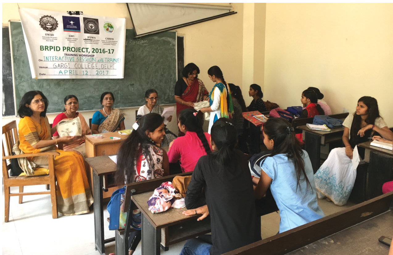
Workshop on Financial Literacy at Gargi College

UWA Delhi (UWAD), a non governmental organisation was founded by 10 members from academia in 1949 and registered in 1950 as Association of Women Graduates of Delhi, changed later to Federation of University Women in India and again in 1964 to University Women's Association of Delhi. Membership is broad-based including not only college and school teachers but also lawyers, doctors, social scientists, journalists, social workers and homemakers. Graduate Students are Associate Graduate members and Scholarship awardees are Associate members. Membership of UWAD which was more than 200 at one time is less than 50 now including 10 Life members. UWAD was affiliated to International Federation of University Women (now GWI) through Indian Federation of University Women's Association (IFUWA). UWAD has its office at All India Women's Conference (AIWC) hostel 6 Bhagwan Das Road, New Delhi.