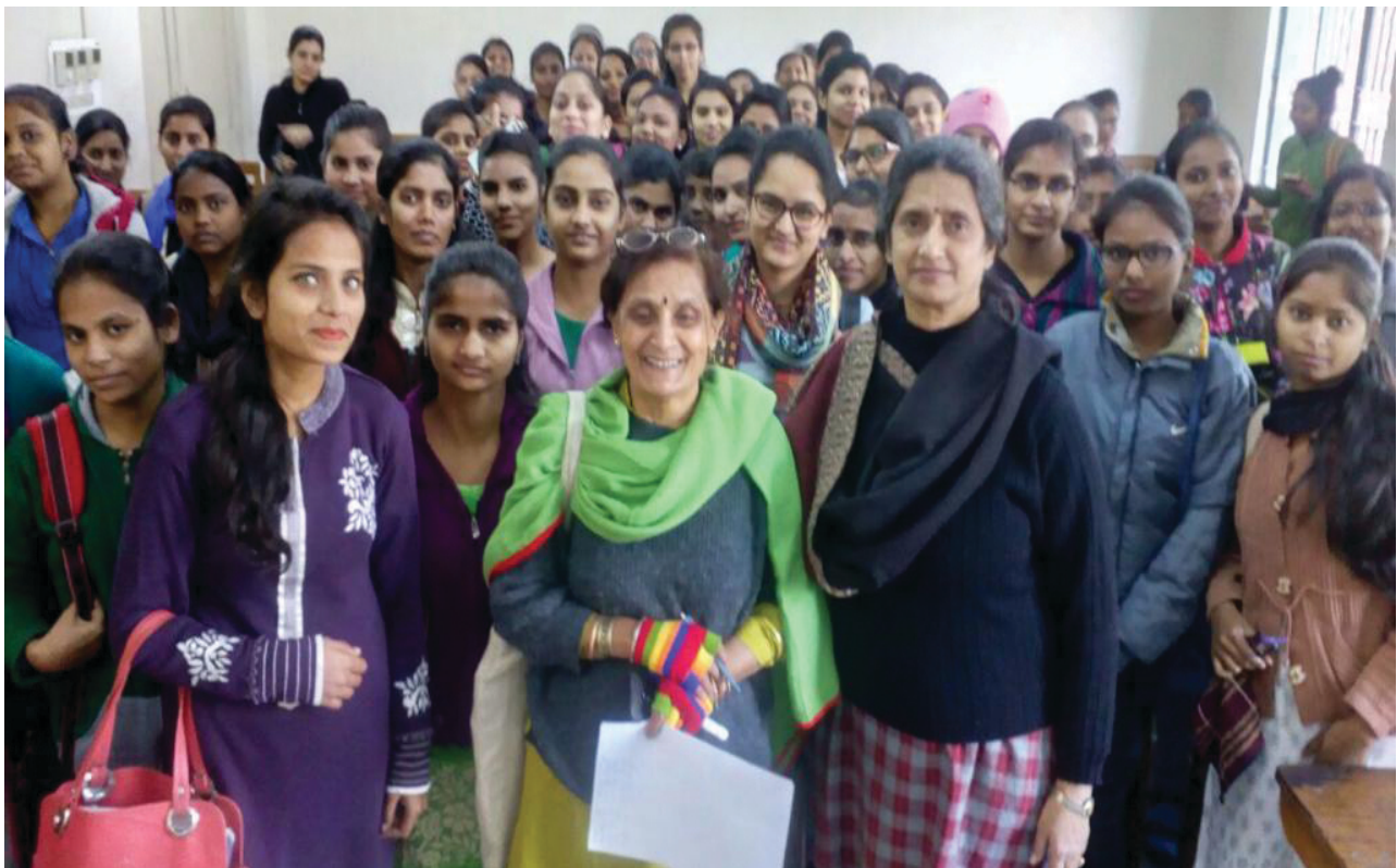
Members with scholarship holders