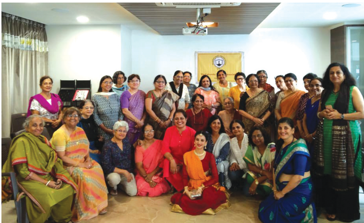
Members of the Association