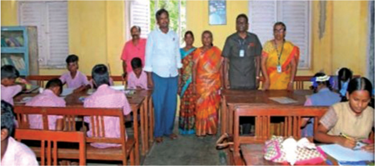
Children's Day Competition for the Girls Students