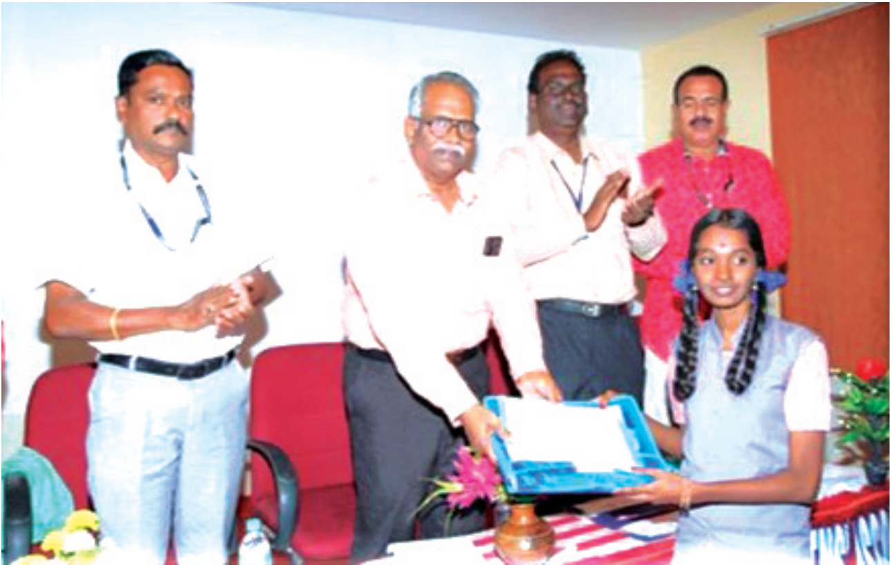
Prize Distribution by Syndicate member