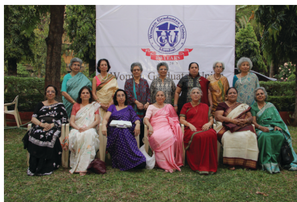
Centenary Celebration in 2015

i) In 1965, WGU celebrated its Golden Jubilee with an exhibition on "The Role of University Women in a Developing Economy". The exhibition was inaugurated by Dr. Zakir Husain, Vice President of India, he stated "The competence with which the exhibition