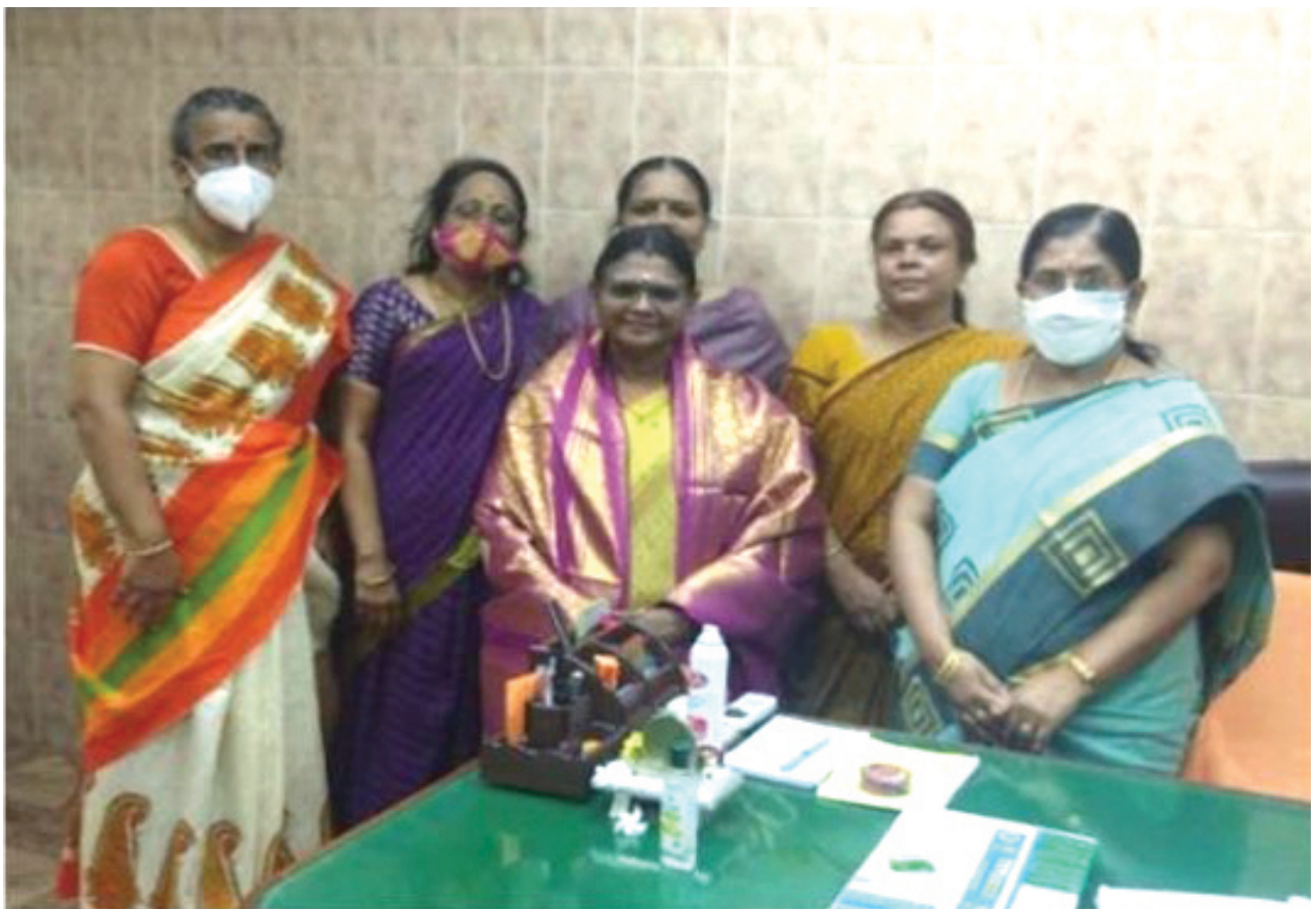
Honouring the President of UWA Chidambaram Chapter