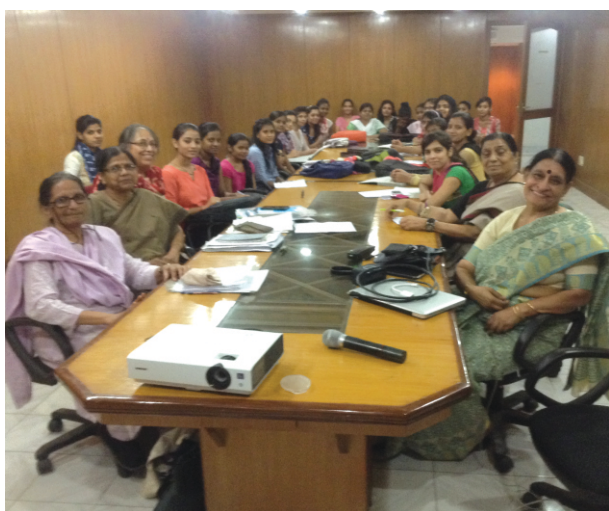
Block Printing Workshop at Gargi College

The project on "Improving health and nutritional