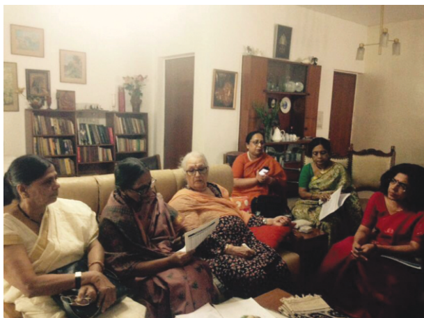
Members attending AGM 2016

impart skills in personality development and leadership for self reliance. Nearly 150 women and girls from low income groups from different states of India were covered in this project.