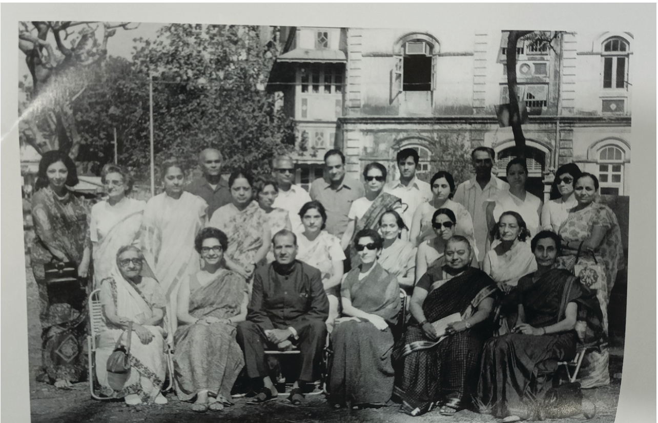
Trustees & Managing Committee of WGU - 1975

Investing in women's growth and development, today, the Union undertakes several projects/activities. Main project being the establishment of Hostel for Working Women. In 1960, WGU took steps to act on the long standing need for a secure, affordable hostel for working women. The Government of India,