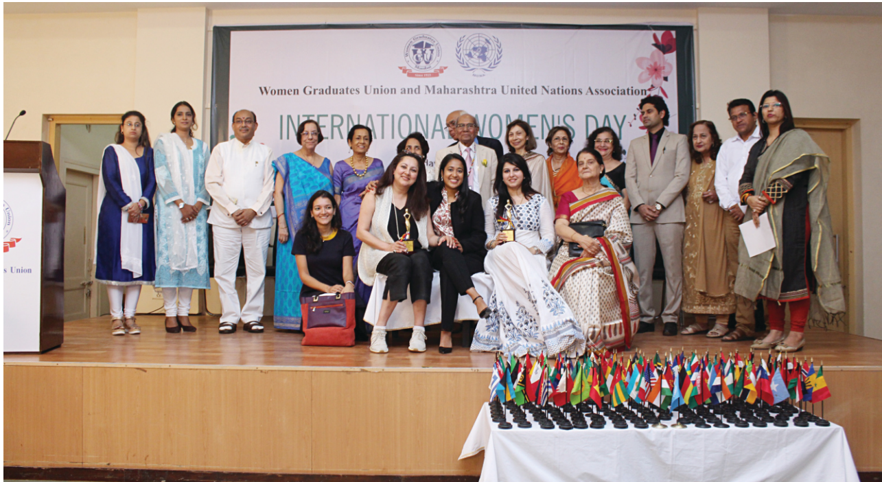
International Women's Day with Maharashtra United Nations Association