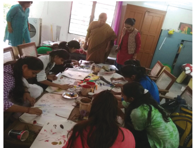
UWAD Managing Committee members at work