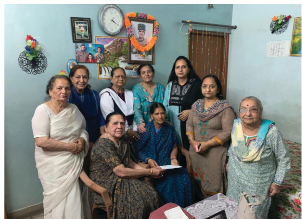
Widow of a Soldier in the Pulwama attack by terrorist in Jammu and Kashmir was given financial assistance. She has three young children studying.

It is said that the final test of a leader is that he leaves behind him or her, in other men and women, the conviction and the will to carry on... UWA Dehradun has introduced and inculcated many new, young members who are academically-inclined and scholarly-motivated and are desirous of carrying on the good work initiated by the stalwarts.