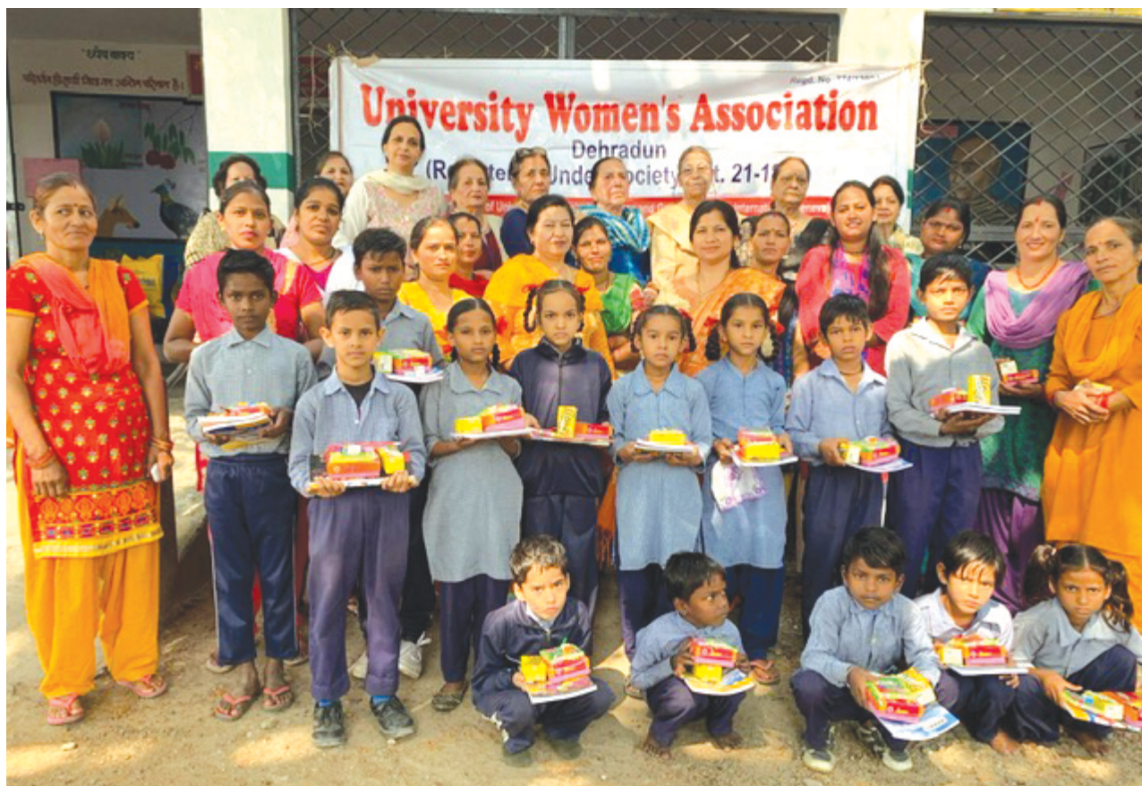
Members of UWA Dehradun celebrating Children's Day with the students of Sauda Saroli Government School. A cultural programme was held and sweets and stationery were distributed.