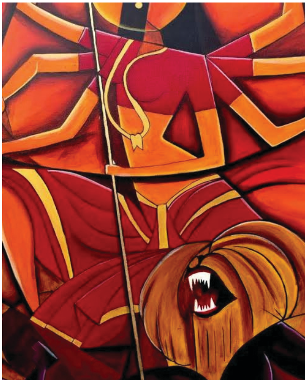
Poster on Elimination of Violence against Women