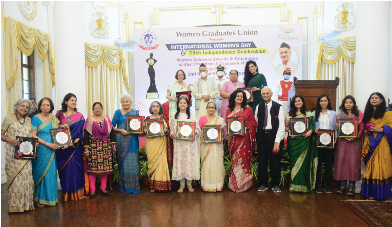
Oration at Raj Bhawan