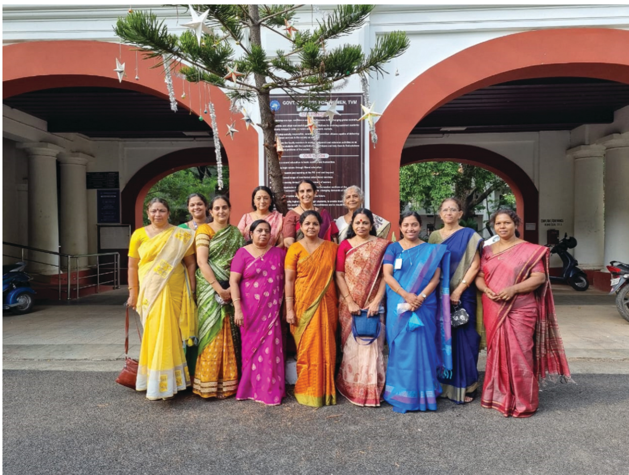
Executive Committee members at Govt. College for Women with Principal, after awareness programme